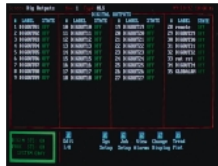
Digital Output screen

The screen can be used to view the current digital output settings status and to force an output on or off. It is also a useful tool for testing or troubleshooting.