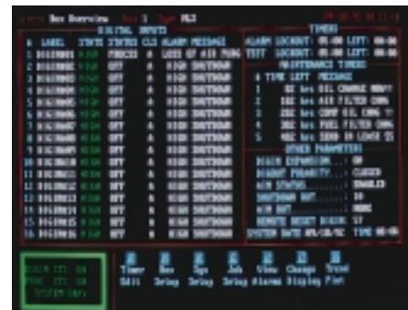
Digital Input screen

This digital input screen shows the status of each input, the type of alarm programmed for each input and the alarm message can be displayed. Maintenance timers are also viewed and set from this screen.